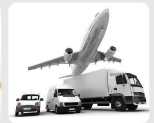
• Logistic & Transportation