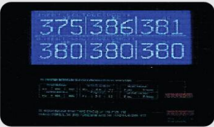
3 Phases Voltage Display