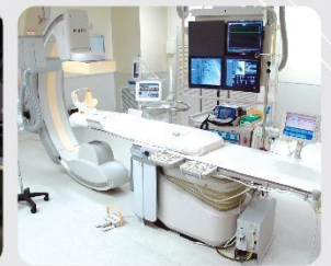
• Hospital & Medical Equipment