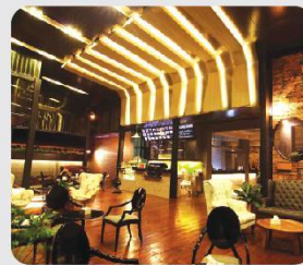
• Hotel & Resort