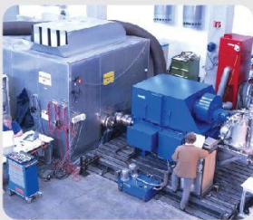
• Industrial & Manufacturer