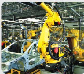
• Auto-mobile Industrial