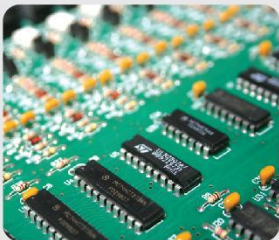
• Electronic Industrial