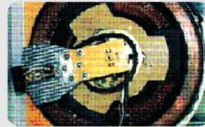
Voltage Regulating Tranformer