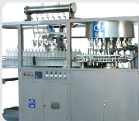
• Auto Machine