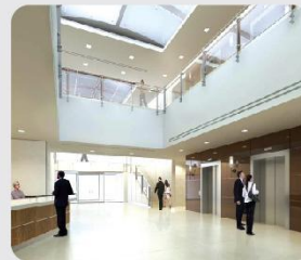
• Office Building