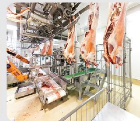
• Food Industrial