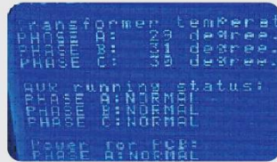
Running Status Checking